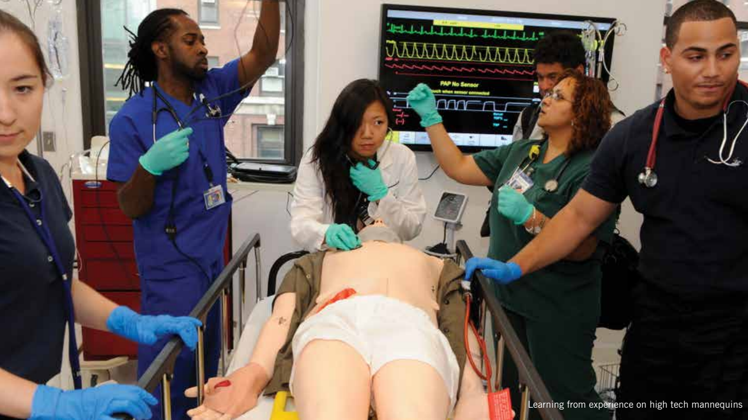
Learning from experience on high tech mannequins